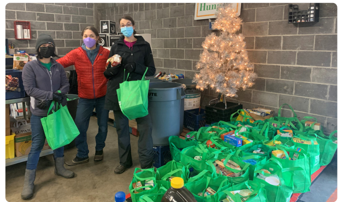
AWS Elemental packing food for residents of their adopted building

Ten home-bound residents unable to travel to Preston's Pantry receive a monthly Delivered Food Box at their doors with a week's supply of fresh produce, meat, dairy items, and pantry staples. If desired, volunteers from your group will have the chance to help pack boxes and deliver them to the door of residents.