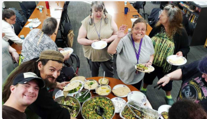
Residents enjoying dinner made at Supper Club