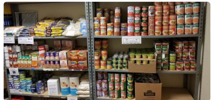
Emergency Food Closet at Gray's Landing

On-site Emergency Food Closets provide non-perishable options for residents experiencing an unexpected food shortage.