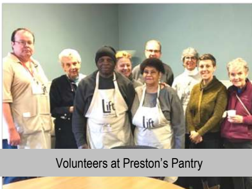
Volunteers at Preston's Pantry

Thank you to all of the volunteers who contribute thousands of hours supporting our community and providing food access to low-income residents in need. With your help, we are able to connect neighbors to nourishment!