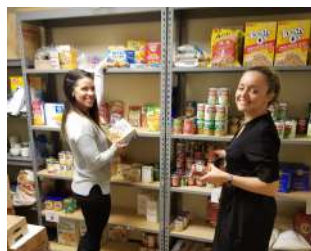
Emergency Food Closet