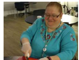
A resident at Supper Club