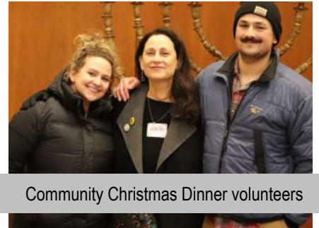
Community Christmas Dinner volunteers