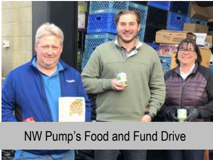
NW Pump's Food and Fund Drive

*A comprehensive list is available at www.lifurbanportland.org