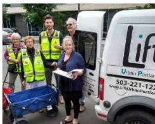
Pearl District Foot Patrol